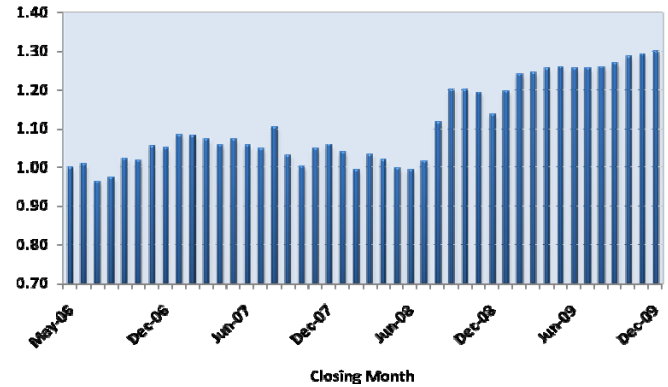
A$ Unit Price