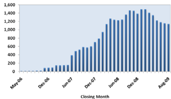
A$ Fund NAV ($m) Not Allowing for Hedge